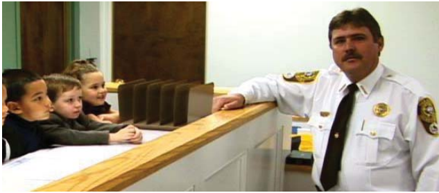
Sheriff Danny Presgraves Page County

We can prevent childhood unpreparedness. Children who succeed in school are less likely to enter the criminal justice system as adolescents. 1 For every $1 invested in early childhood development, we save $5 in crime costs down the line. 2